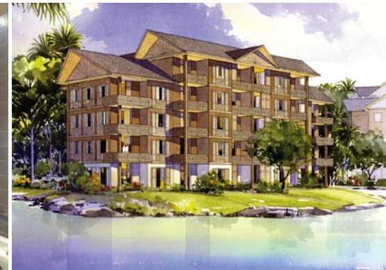
Artist impression of Spa Villa

All plans, information and specifications contained herein are subject to change without notification as may be required by the relevant authorities or the Developer's consultants and cannot form part of an offer or contract. All illustrations and pictures are artist impressions only. While every reasonable care has been taken in providing this information, the Developer cannot be held liable for any errors or misrepresentation or changes. The items are subject to variations, modifications and substitutions as may be recommended by the Company's consultants and/or relevant Approving Authorities.