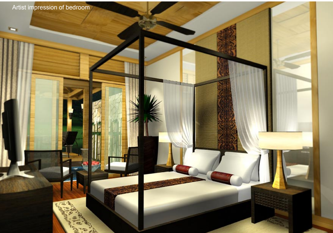
Artist impression of bedroom