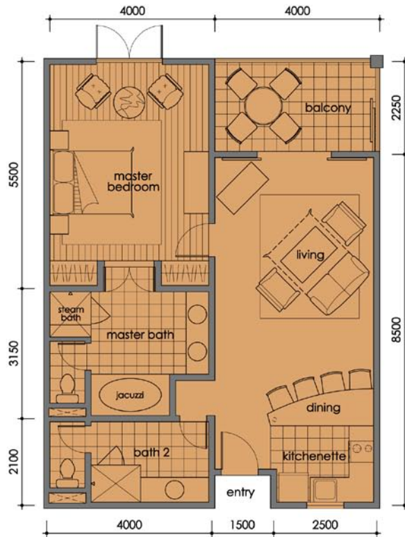
1+1 spa villa 927 sq ft