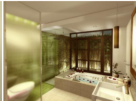
Artist impression of master bath