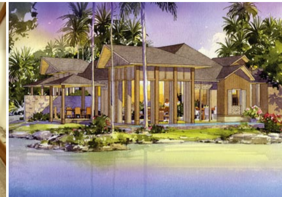
Artist impression of Pool Villa

All plans, information and specifications contained herein are subject to change without notification as may be required by the relevant authorities or the Developer's consultants and cannot form part of an offer or contract. All illustrations and pictures are artist impressions only. While every reasonable care has been taken in providing this information, the Developer cannot be held liable for any errors or misrepresentation or changes. The items are subject to variations, modifications and substitutions as may be recommended by the Company's consultants and/or relevant Approving Authorities.