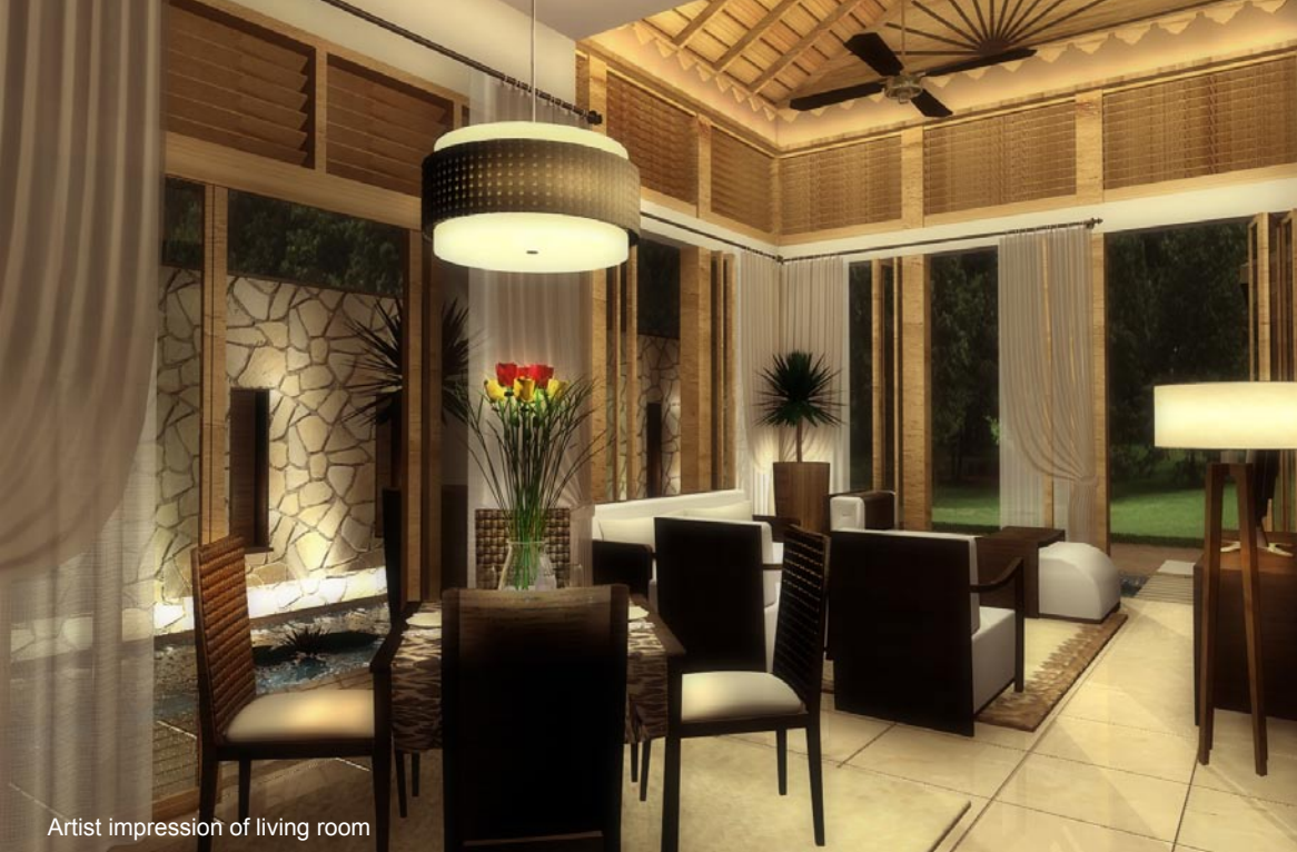
Artist impression of living room