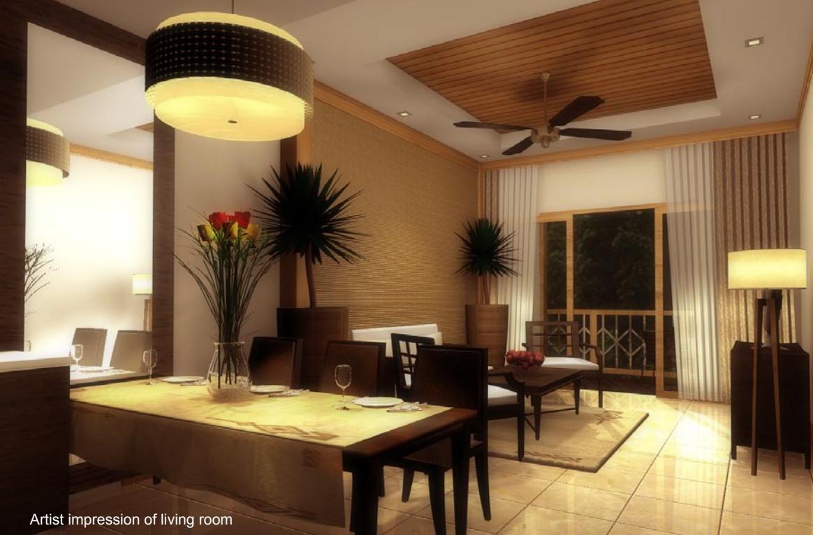
Artist impression of living room