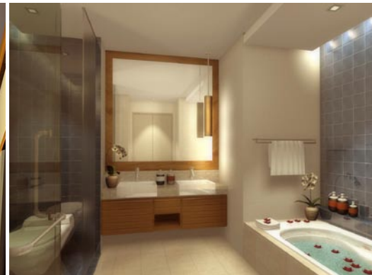
Artist impression of master bath