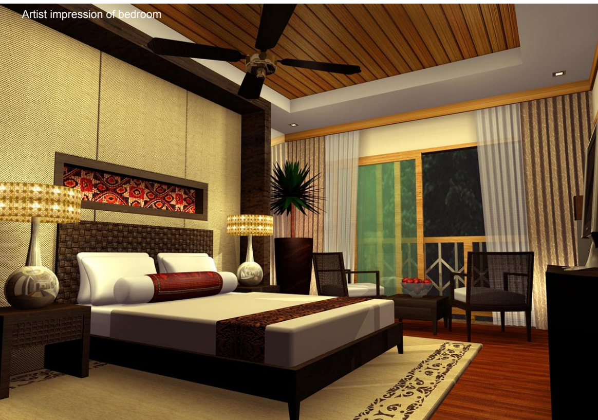
Artist impression of bedroom